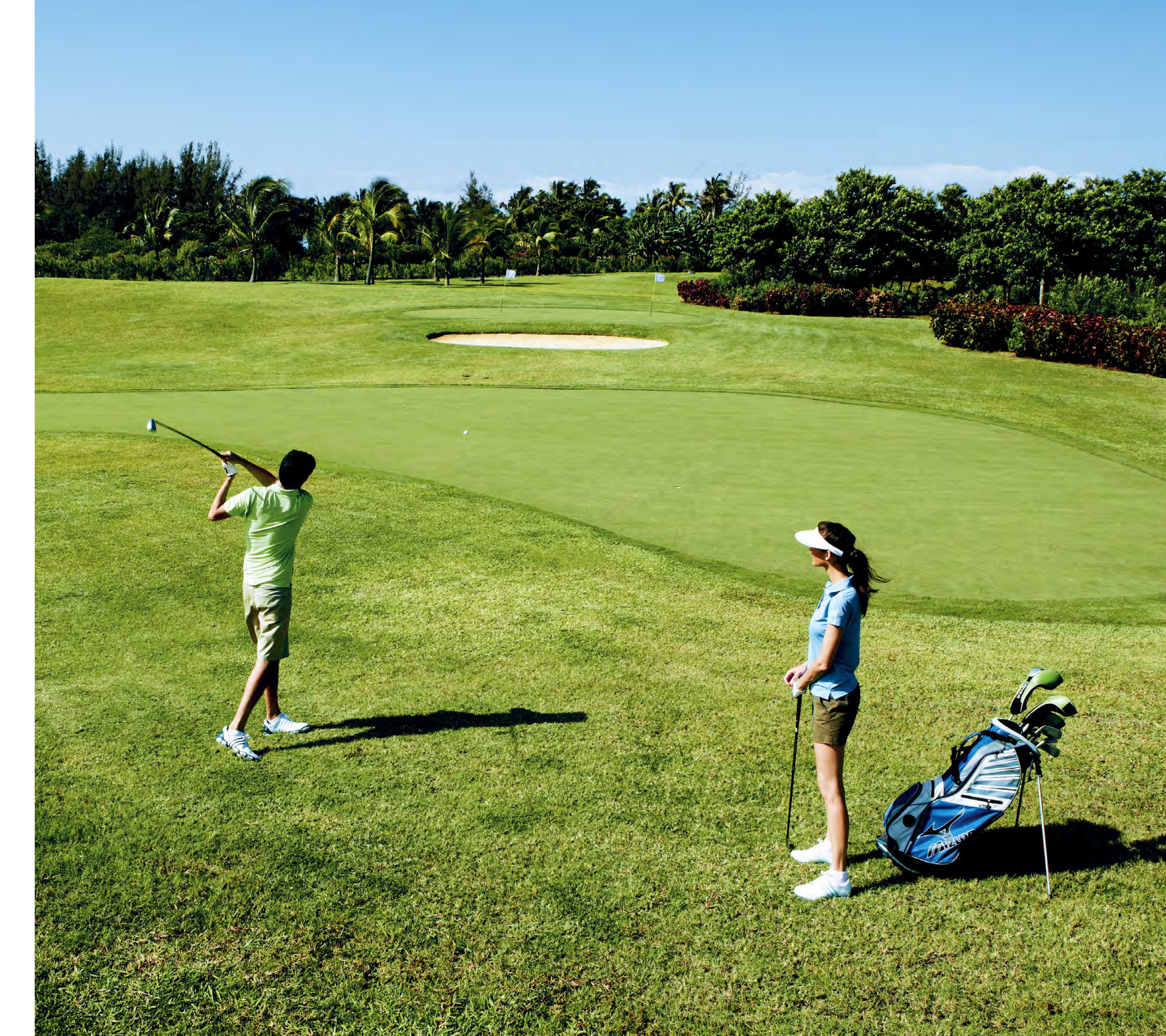
ANYONE FOR TENNIS OR GOLF? OR, IF YOU CAN BEAR TO LEAVE, VENTURE OUT FOR SAILING, KAYAKING, TREKKING OR MOUNTAIN-BIKING.